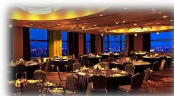
JR Tower Hotel Nikko Sapporo

Our registration fee includes welcome reception, 4 times lunches, excursion with lunch box and also banquet party at the top of the JR Tower Hotel Nikko.